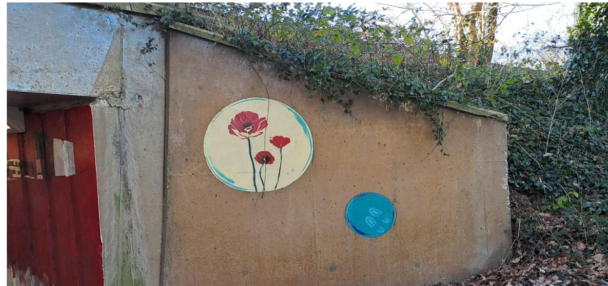
This is one area in which graffiti was removed.