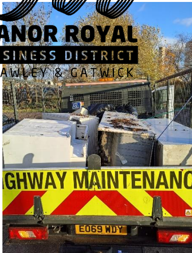
Fridges and washing machine from Kelvin Way.