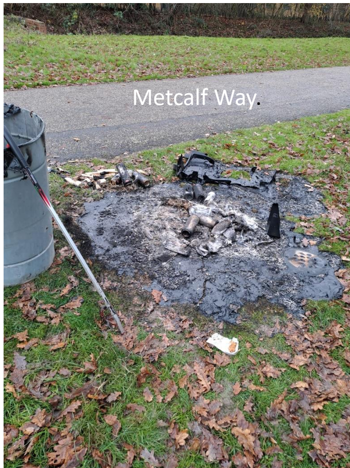
Here are some of the fly tips we have received during Dec/Jan. Even a burnt-out bin which have now been cleared and reinstated.