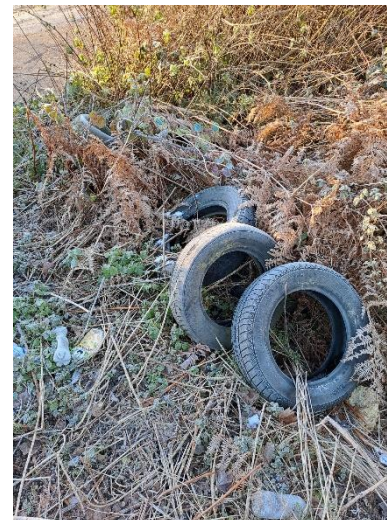
Tinsley Lane North.