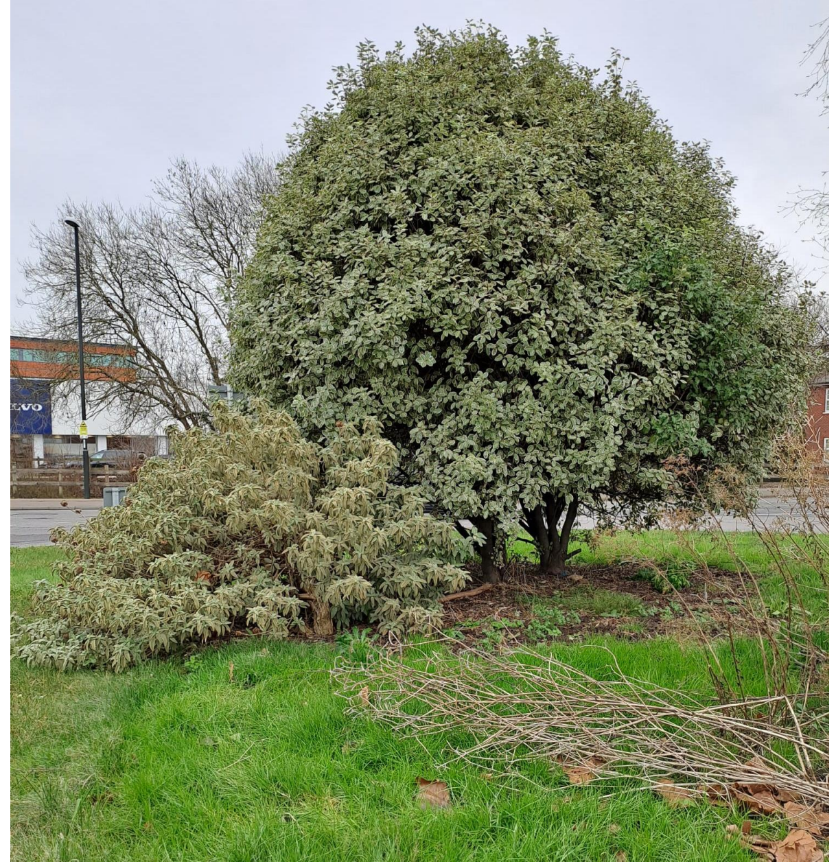
We have attended to the shrubs on Gateway 1 roundabout.

We will be starting to incorporate some wildflowers into small pockets to add colour and encourage wildlife.